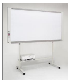
N-18W Wide Model