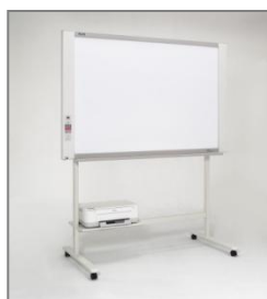
N-18S Standard Model